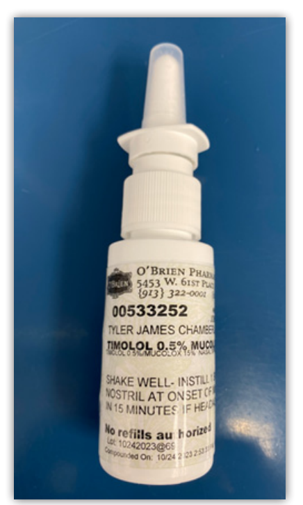
Figure 1. Sample nasal timolol 0.5% prescription (figure used with permission from Tyler Chamberlain, PharmD).

She was a poor responder to triptan medication and was overusing overthe-counter (OTC) analgesic medications. Due to poor insurance coverage and excessive patient co-pay, she had difficulty getting access to newer CGRP blocking medications.